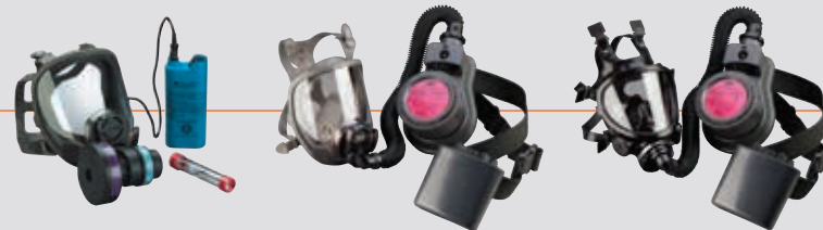
Face-mounted PAPR † (available for 6000 FF only)