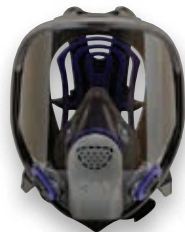
Ultimate FX FF-400